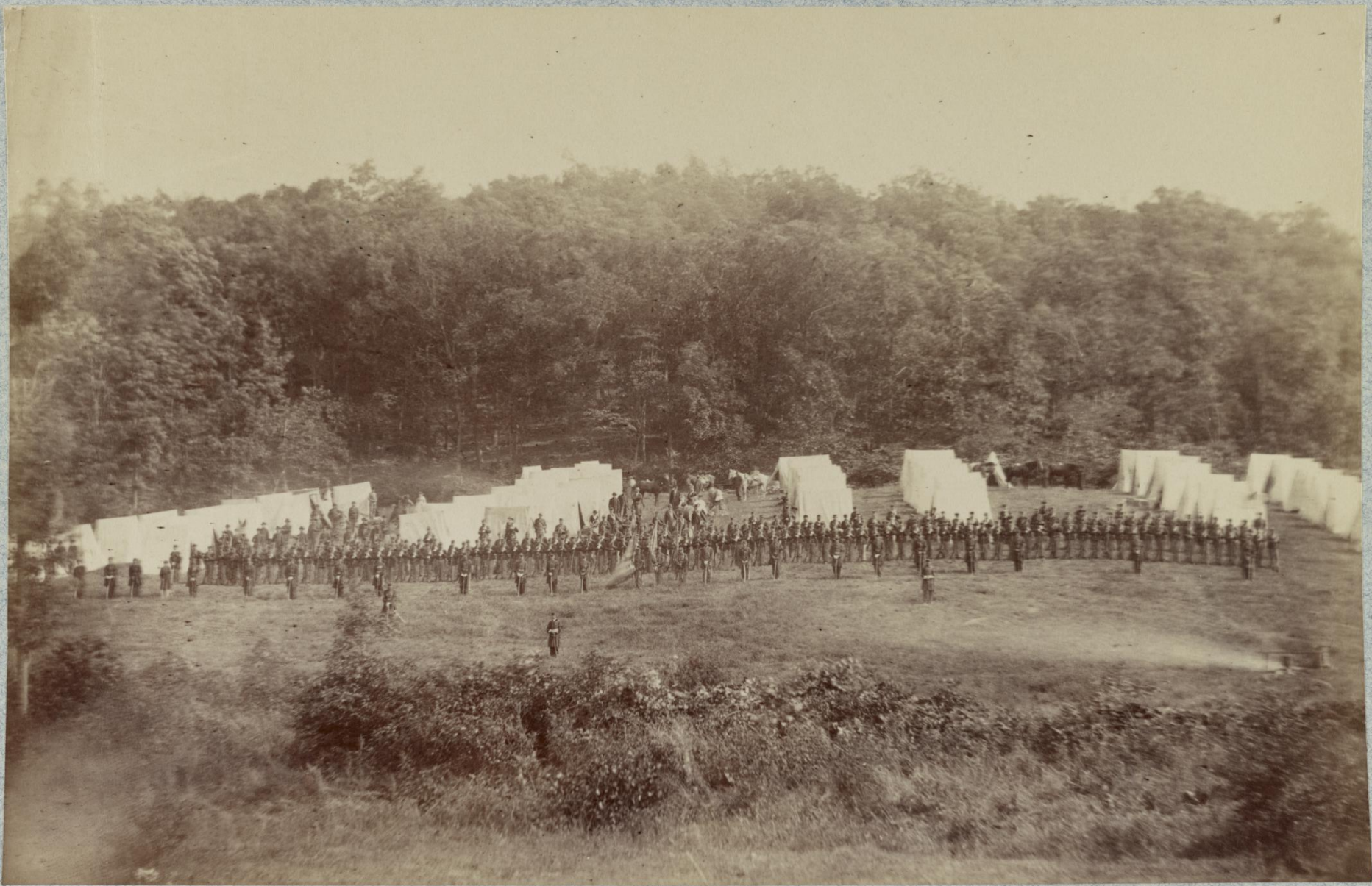
25 50th Pennsylvania Infantry, Gettysburg, Pa., July, 1865 http://www.loc.gov/pictures/resource/ppmsca.33199/?co=cwp